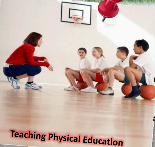
Teaching Physical Education

The Department of Health, Physical Education, and Recreation offers the Bachelor of Science in Education degree in Health, Physical Education, and Recreation; the Bachelor of Science degree in Athletic Training; and the Bachelor of Science degree in Health, Physical Education, and Recreation that includes concentrations in Physical Education, Recreation, Sports Information, Sports Management, and Exercise Science. The advanced degree offered by the department is the Master of Education in Health, Physical Education, and Recreation.